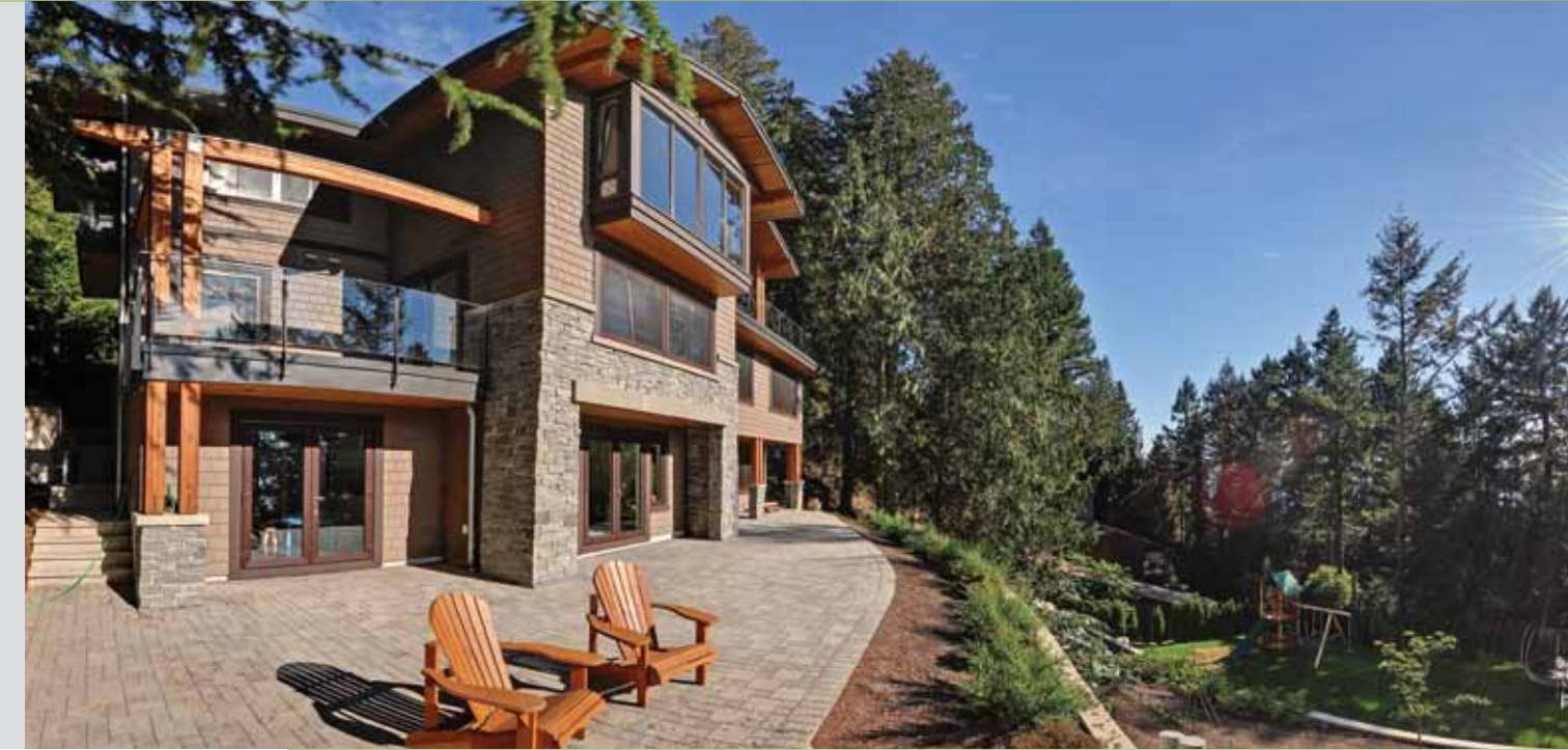
Tilt + Turn Windows and Terrace Swing Doors in Chocolate Brown Acryl-Protect Exterior